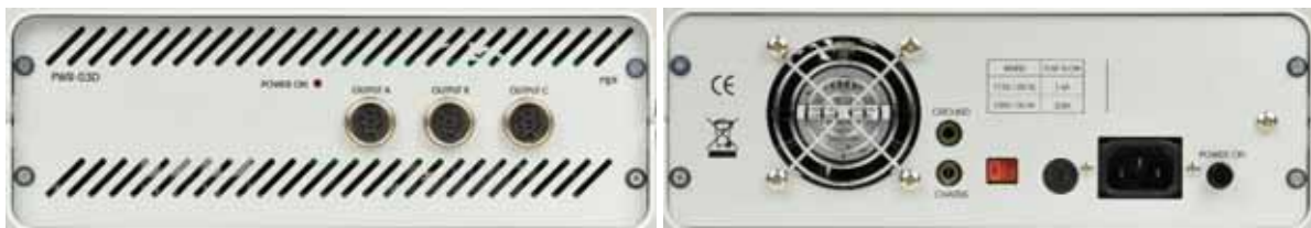
Figure 3: Left: PWR-03D front panel view. Right: PWR-03D rear panel view.

Note: The chassis of the PWR-03D is connected to protective earth, and it provides protective earth to the EPMS-E housing if connected.